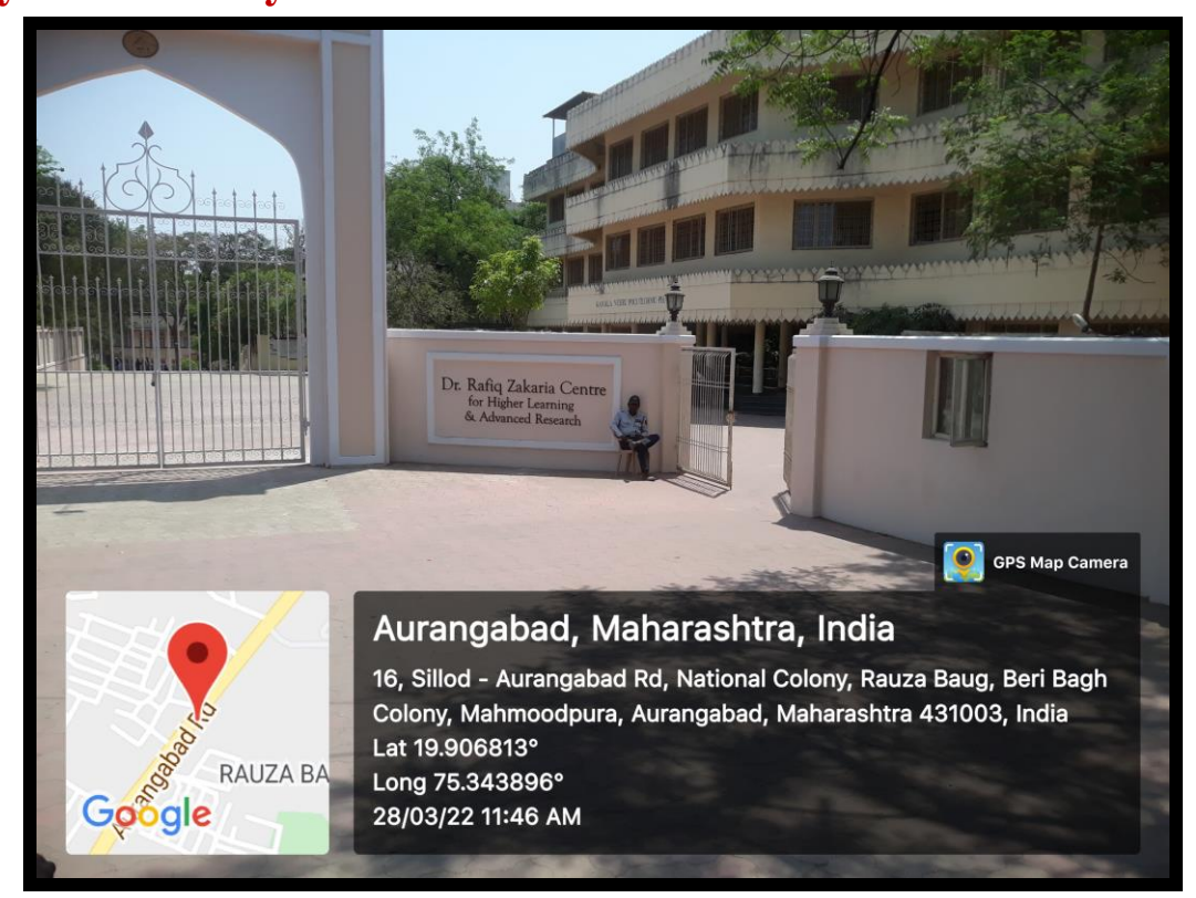
24X7 security on the campus