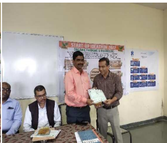
Appreciation of the judges