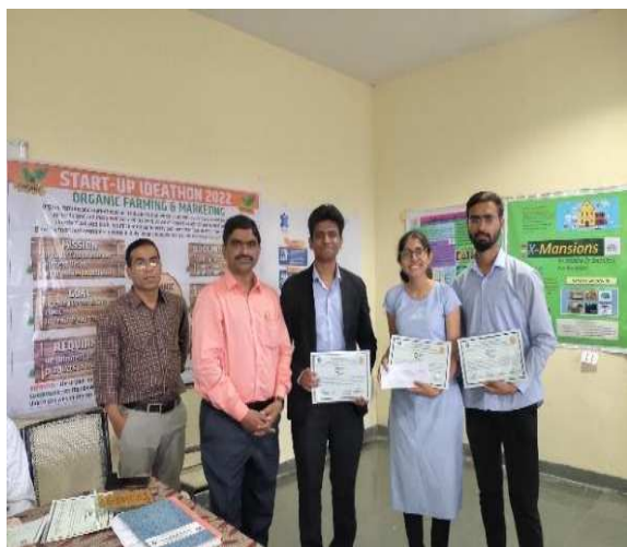
The third runner up team