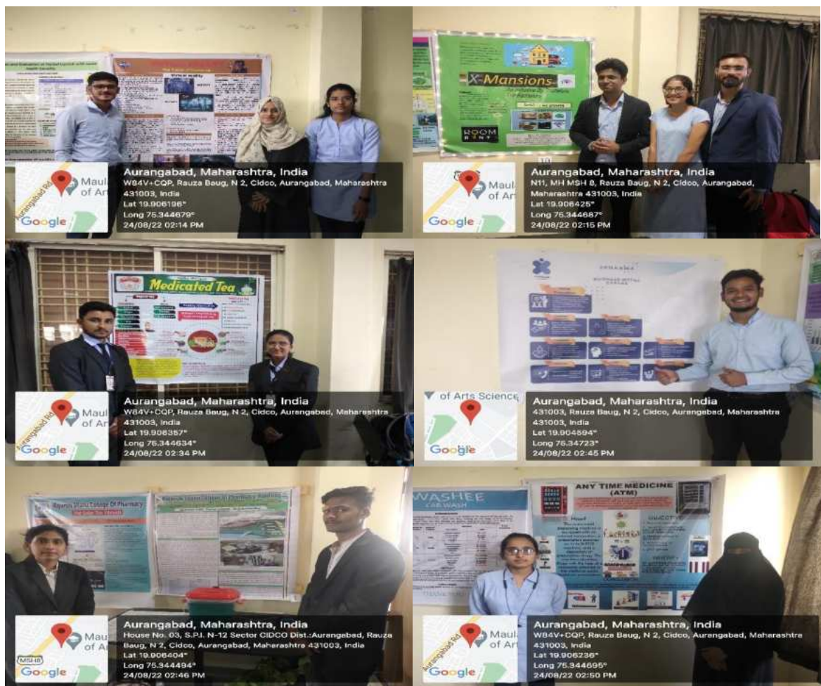
The team members displaying their innovative startup ideas