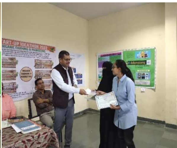
The second runner up team