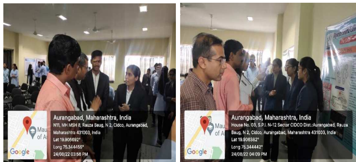
Judges evaluating the poster