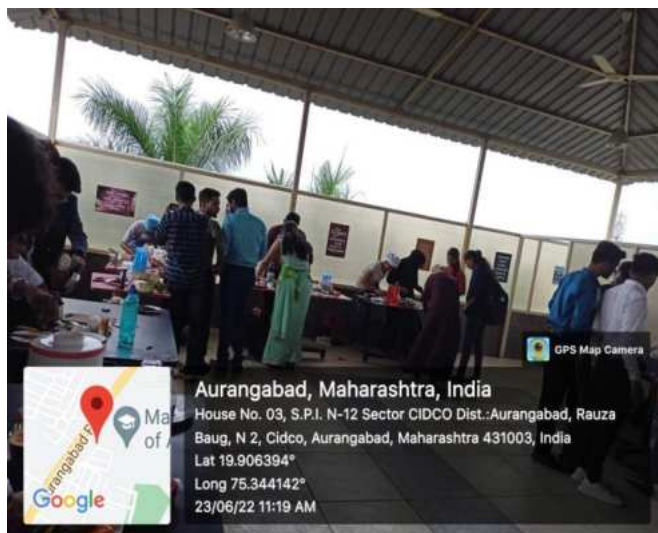
Participants at work