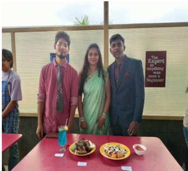
Team members presenting their delicacy