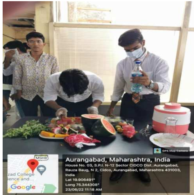
Team members at work