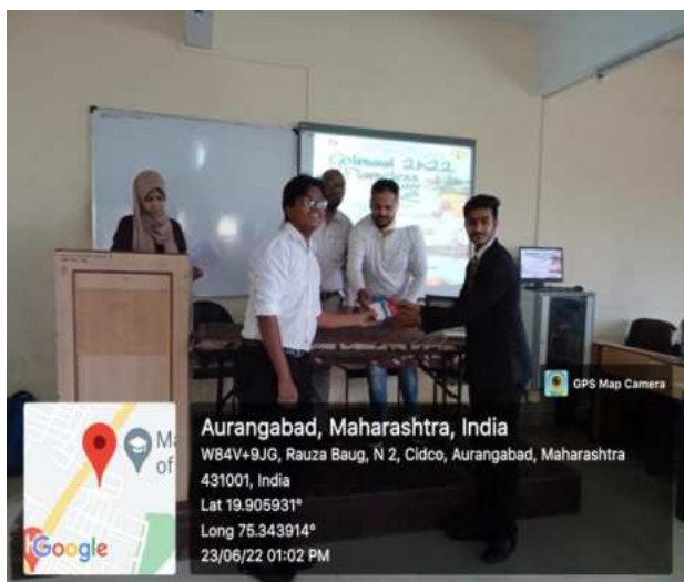
The first prize winning team