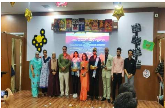
The judges, Activity in-charges and SPICES coordinator with the winners