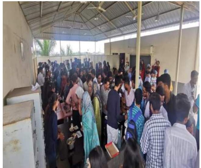
Event at a glance