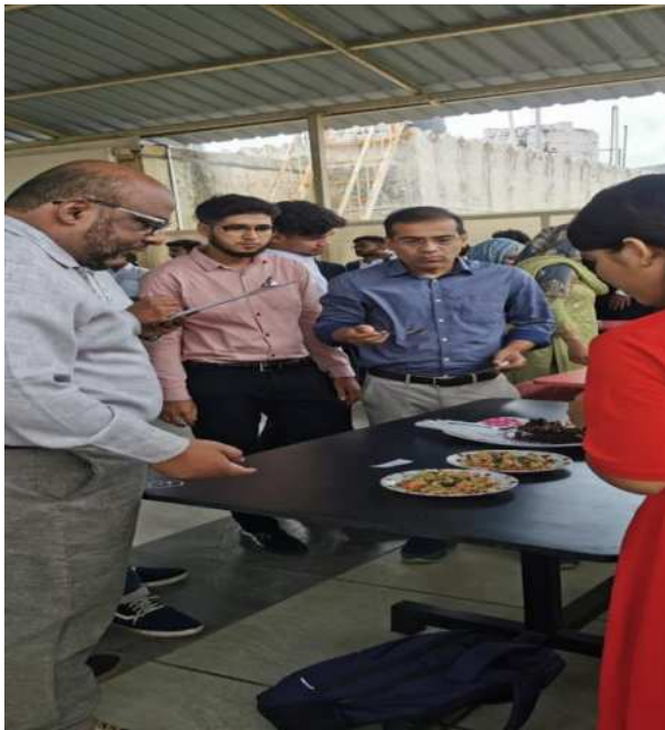
The evaluation round