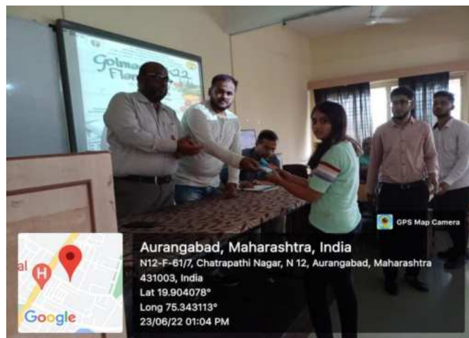
The third prize winning team