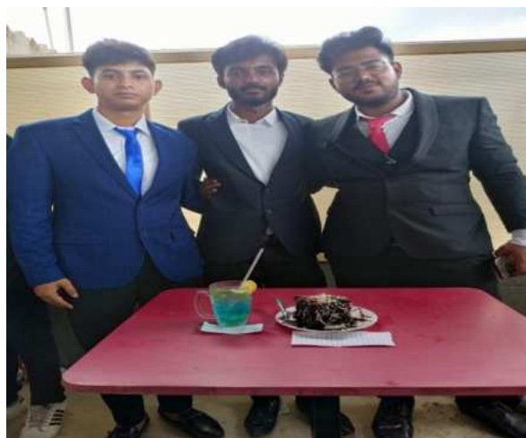
The team members displaying their preparation