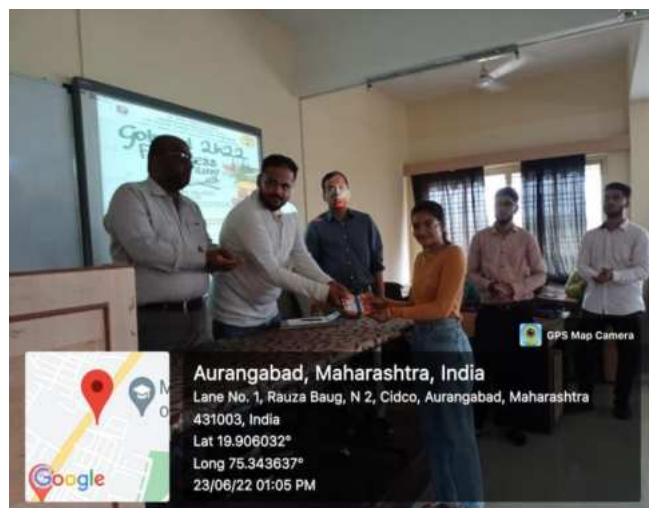
The second prize winning team