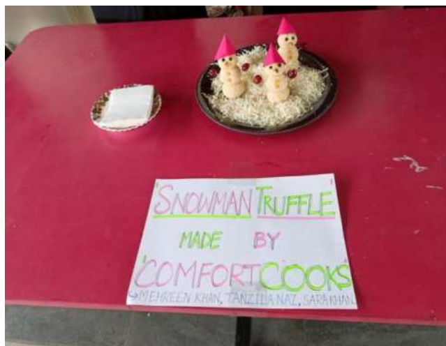
Snowman truffle prepared by Team- Comfort Cooks