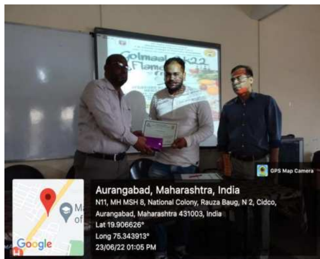
Felicitation and appreciation of the judge at the hands of convener