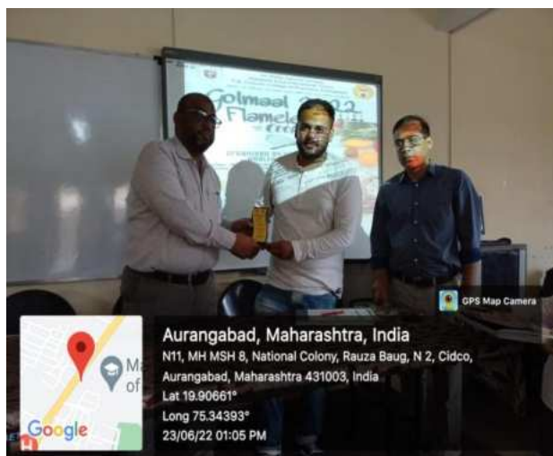
Felicitation and appreciation of the judge at the hands of convener