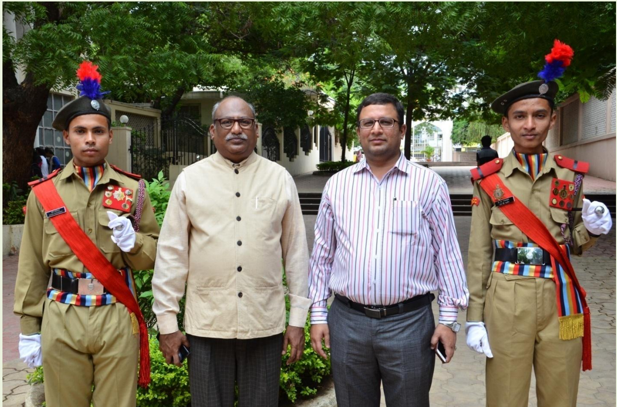
Volunteers & Principal's participation in Mass Recitation of National Anthem