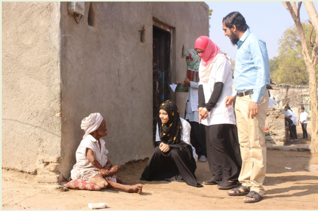
Survey of gopalchauwdi village by NSS team members