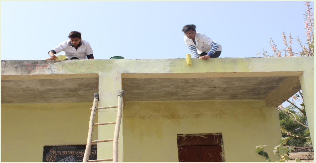
NSS Volunteers performing colouring to village school.