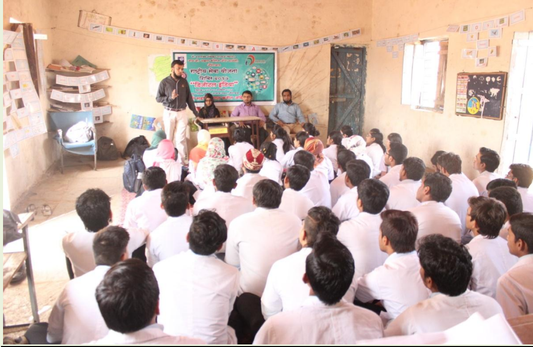
NSS Camp inauguration at Gopal chauwdi.