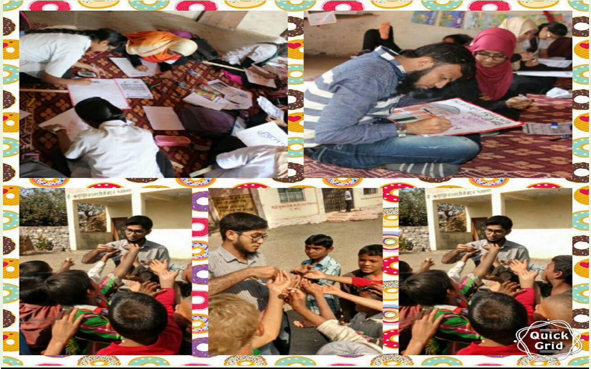
Republic day celebration at village school.