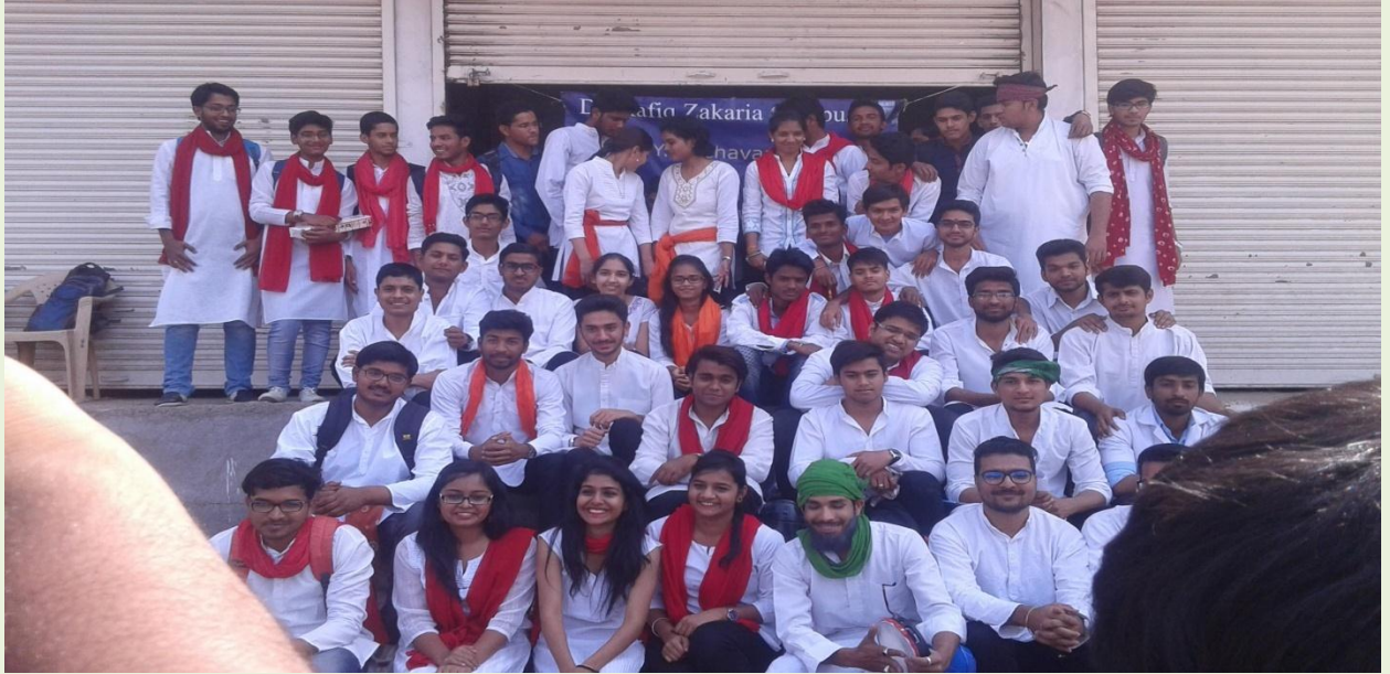
NSS Team of YB for Street Show

The N.S.S. volunteers of Y.B.Chavan College of Pharmacy conducted and participated in “Street show” on 2 nd Jan. 2017 to educate the people about Diabetes at Rauza Bagh corner Aurangabad.