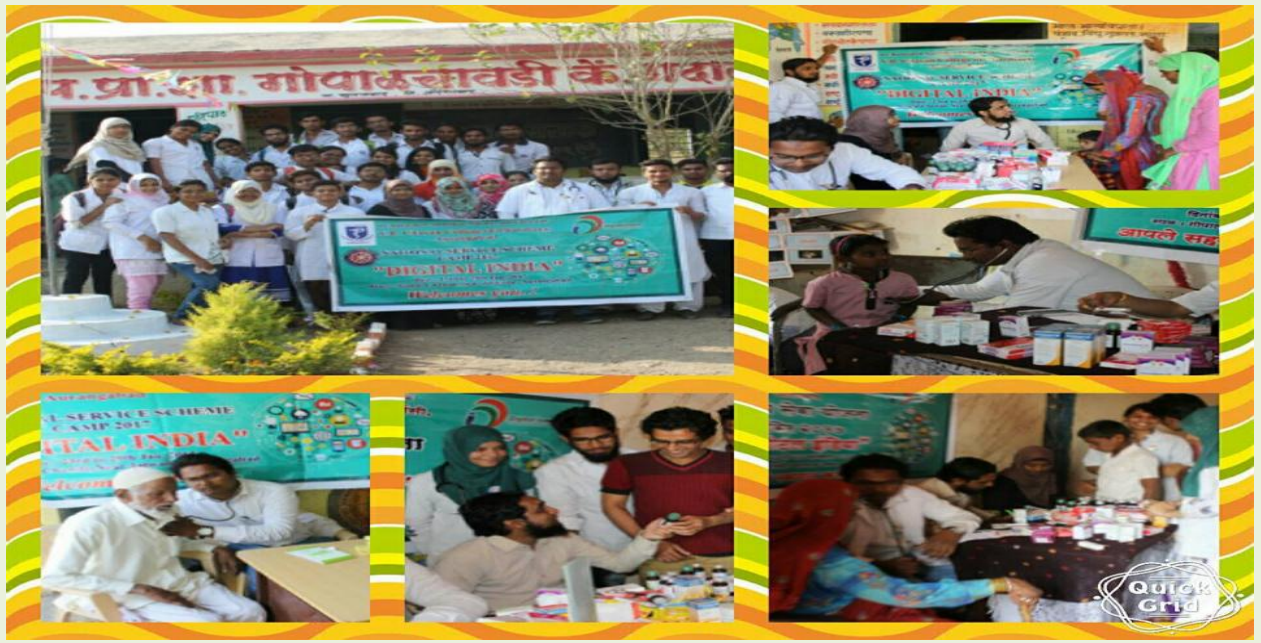
Medical checkup Camp at village.