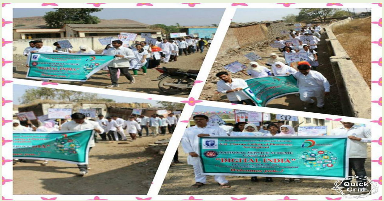
Rally in village for Cashless Awareness