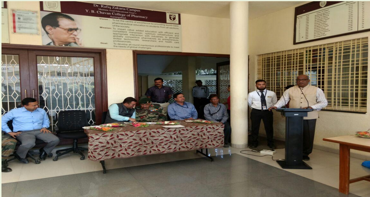
Blood Donation Camp at College Campus in collaboration with HDFC Bank-2017