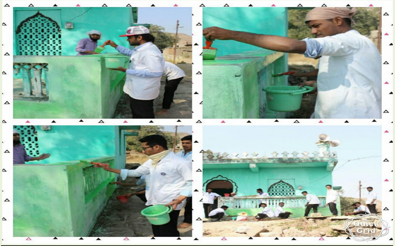
NSS Volunteers performing colouring to village mosque.