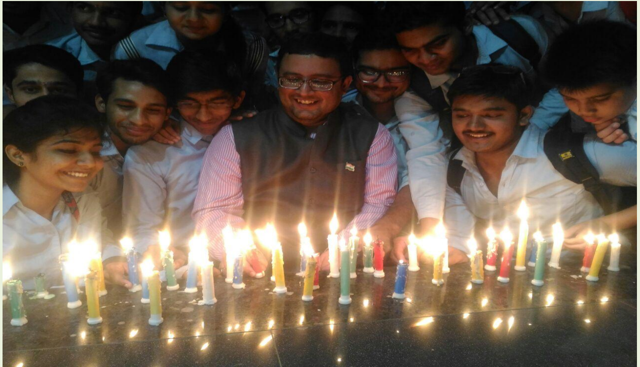
NSS Team for Candle Light Freedom March (Azaadi 70 Yaad Karo Qurbani)