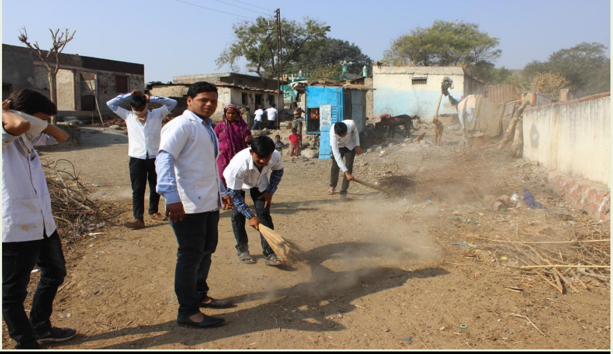
NSS Volunteers performing village cleanliness.