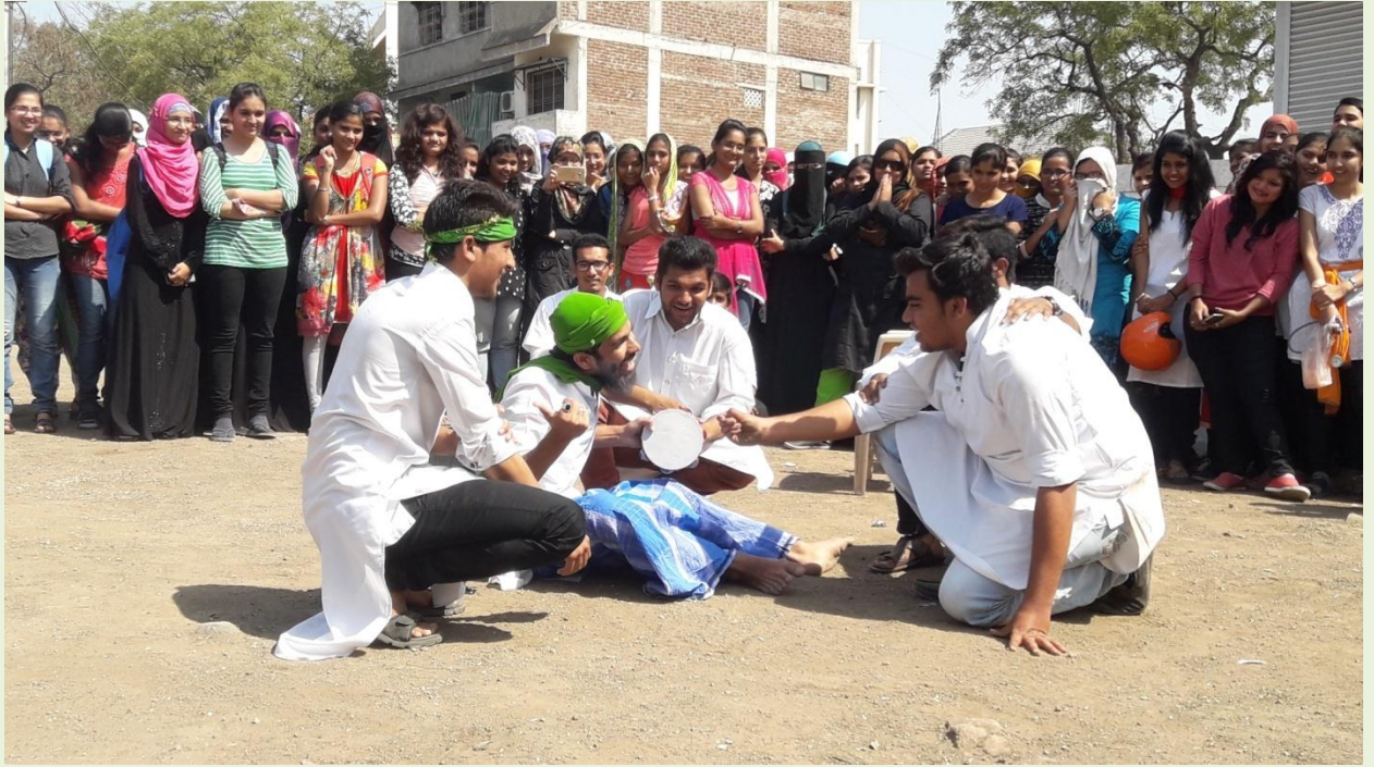
NSS volunteers performing the street Show

NSS volunteers performing the street Show at Govt. College and wins the first Prize in intercollegiate competition.