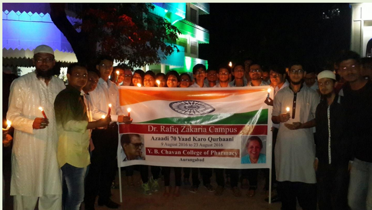
NSS Team for Candle Light Freedom March (Azaadi 70 Yaad Karo Qurbani)

The “ Candle light freedom march Azadi 70 ” was conducted on 14 th Aug. 2016 at Dr. Rafiq Zakria Campus Aurangabad, and about 1000 volunteers have taken part in this activity.