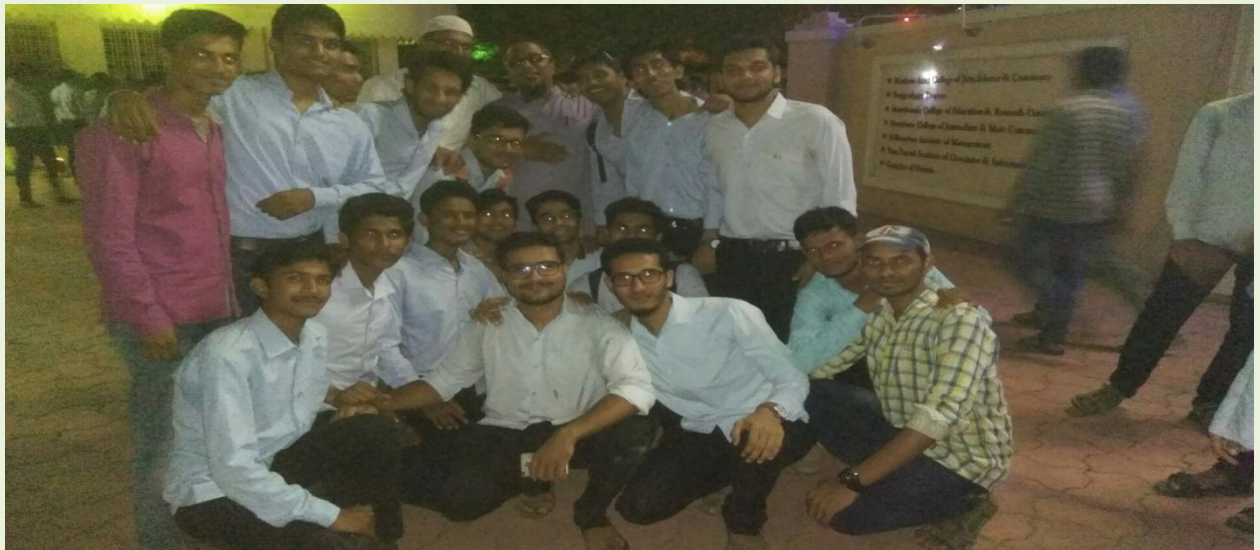
NSS Team for Candle Light Freedom March (Azaadi 70 Yaad Karo Qurbani)