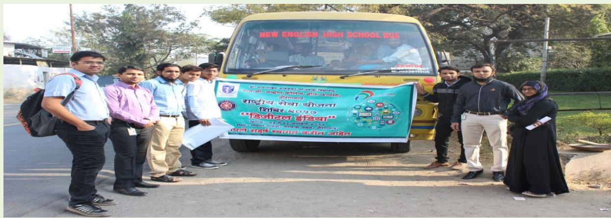
Day1 of NSS camp

The complete details of the camp were also available in the camp report 2016-17.